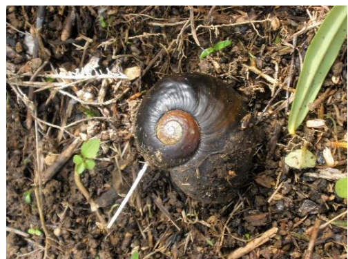
Kauri snail, Omanawanui Track, Whatipu

WRPS submitted on the proposed design of the watchtower at North Piha beach because under the WRHA Act 2008 preservation of the natural character of the coastal environment and the protection of outstanding natural features and landscapes must always be taken into consideration. WRPS strongly supports the water safety of the local residents and visitors to the beach but it was unclear if a 2m increase in the height of the tower is necessary. WRPS wanted to ensure the design is not imposing and is of appropriate character, but there is local concern this will not be the case. There is concern it will not integrate into the landscape, and will in fact have significant effects on visual amenity. However we support that the proposed design does not result in the removal of any vegetation and claims to take up a smaller footprint due to the design.