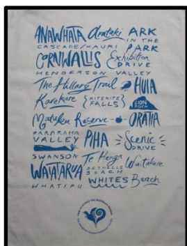
Place names of the Ranges