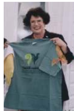
The Hon Judith Tizard with a T-shirt!

Please order your cards and T shirts on the form on the back of this newsletter.