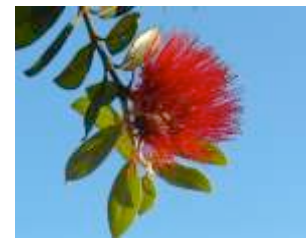
Pohutukawa Flower