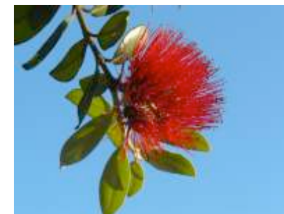
Pohutukawa Flower

Of special interest A walk through the reserve will take you through areas of regenerating