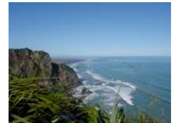
Whatipu from Te Ahuahu

As well as the fascinating heritage photos of the Waitakere Ranges mainly from the Waitakere Central Library, the calendar also contains some very useful Council contact information including due dates for rates and Public holidays.