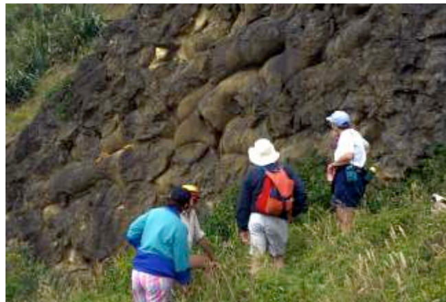
Dike Feeding lava pillow

At Collins Bay there are some large boulders to walk over and these may not suit some participants, but you could choose to return at that point having already seen some of the best exposures.